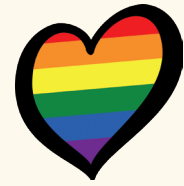
The rainbow flag has become another symbol of the song contest.

even won the ESC, namely Dana International for Israel (1998), the Dutch singer Duncan Laurence (2019) and last but not least the Austrian drag person Conchita Wurst (2014). The 2025 winner, JJ (Johannes Pietsch) from Austria, has identified as queer. The same applies to Swiss contestant Nemo, who won in 2024. Even though there has been some strong homophobic criticism of Conchita's performance before the final, ESC organisers work hard to make LGBTQIA+ members always feel welcome, included and safe.