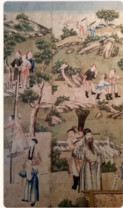
Wallpaper depicting scenes of Chinese life, imported from southern China to one of the "Chinese cabinets" in the Palazzina di Stupinigi, Piedmont, Italy

People had long been fascinated by the exotic nature of luxury products, such as porcelain, silk and lacquerware, that had been flowing into Europe from East Asia since the early 16 th century. These imports stimulated Rococo designers of the mid-18 th century to imitate and adapt oriental motifs and ornaments for a wide variety of objects. They didn't distinguish between what was Chinese, Japanese or Indian, but combined motifs to create an exotic fantasy world. Chinoiserie is characterised by a number of frequently occurring motifs. In 18 th -century Britain, China seemed a mysterious, faraway place. Although trade between the two countries had increased over the 17 th and 18 th centuries, access to China was still restricted and there were few first-hand experiences of the country. Chinoiserie drew on these exotic, mysterious preconceptions. Objects featured fantastic landscapes with fanciful pavilions, sweeping lines of the roofs of Chinese pagodas, fabulous birds and figures in Chinese clothes. Sometimes these figures were copied directly from Chinese objects, but more frequently they originated in the designer's imagination. Mythical beasts such as dragons also became a common Chinoiserie motif, summing up all that was strange and wonderful about the East.